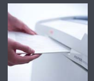
PAPERcontrol for measuring the paper thickness – prevents paper jams.