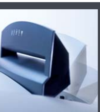
Folding safety element with contact protection and integrated service flap.