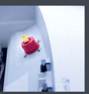
The automatic oiler ensures a consistent cutting capacity and